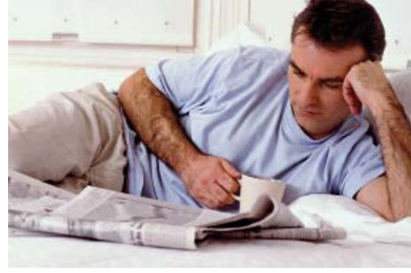
Relaxation and sleep are important factors in the healing process.

function and cause pathological motor patterns to become fixed. Therefore, we see more musculoskeletal problems in psychologically labile athletes. The main changes may be grouped into three categories: